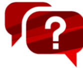
Open Access FAQ