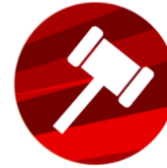
Open Access Policy