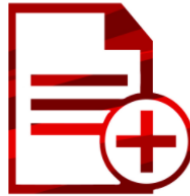
Deposit Your Article